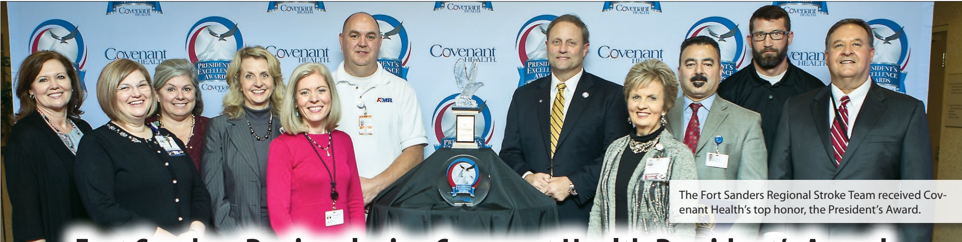
The Fort Sanders Regional Stroke Team received Covenant Health's top honor, the President's Award.