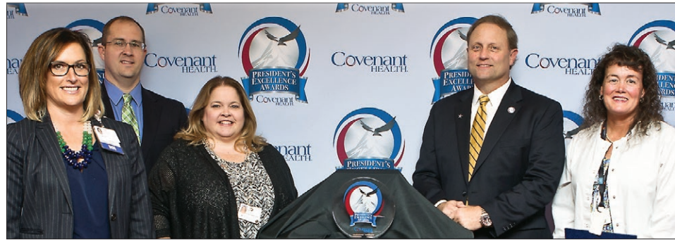
Fort Sanders Regional's iCough project was honored in the team achievement category.

"ICOUGH – Post-Operative Pneumonia Reduction and Cost Savings"